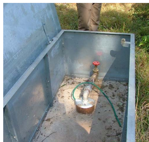
Equipped with Submersible Pump