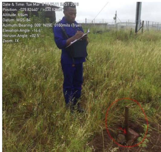
Drilling Point – Pegged