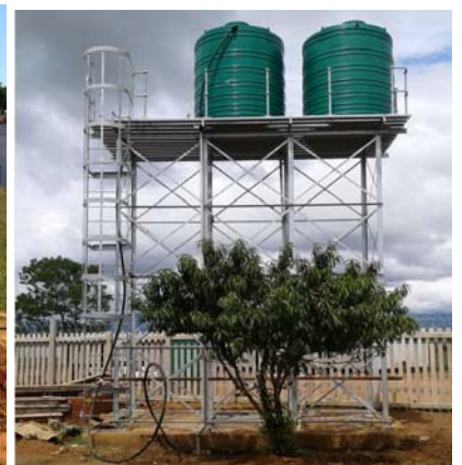
Pump Equipping and elevated Tanks (Under Construction)