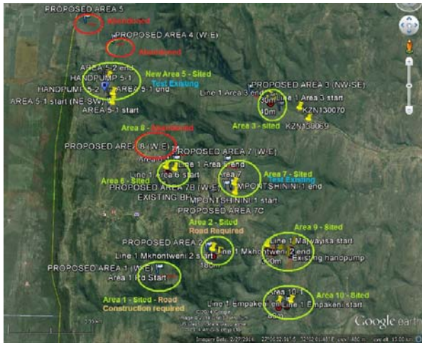
Identify Potential Drilling Area