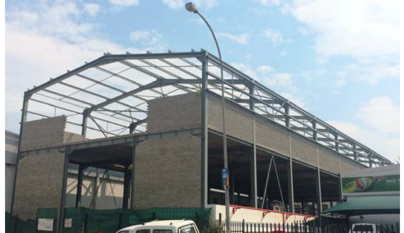
Exterior View of Warehouse